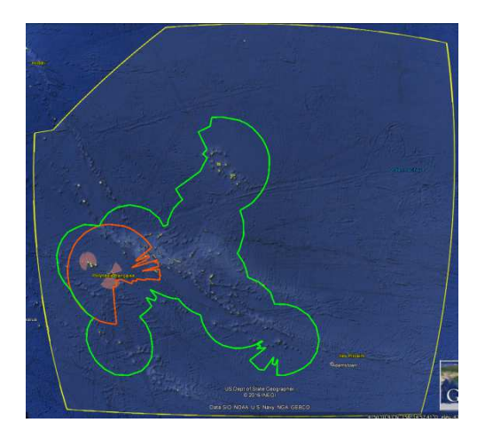
Phase I 2017/2018: redlines Phase II 2018/2020: green lines

• In addition to the PBN implementation plan, an ADS-B beacon deployment and related remote VHF antennas is on progress.